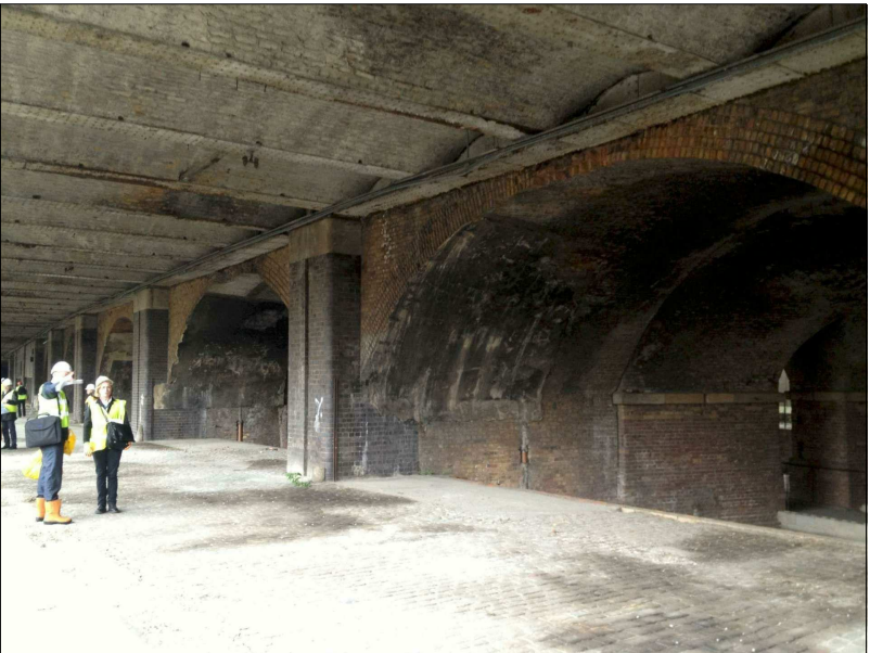
JACK ARCHED LID TO LONDON ROAD - This significantly contributes to the character of London Road and is generally to be retained and repaired with cut outs over the new Public Squares.